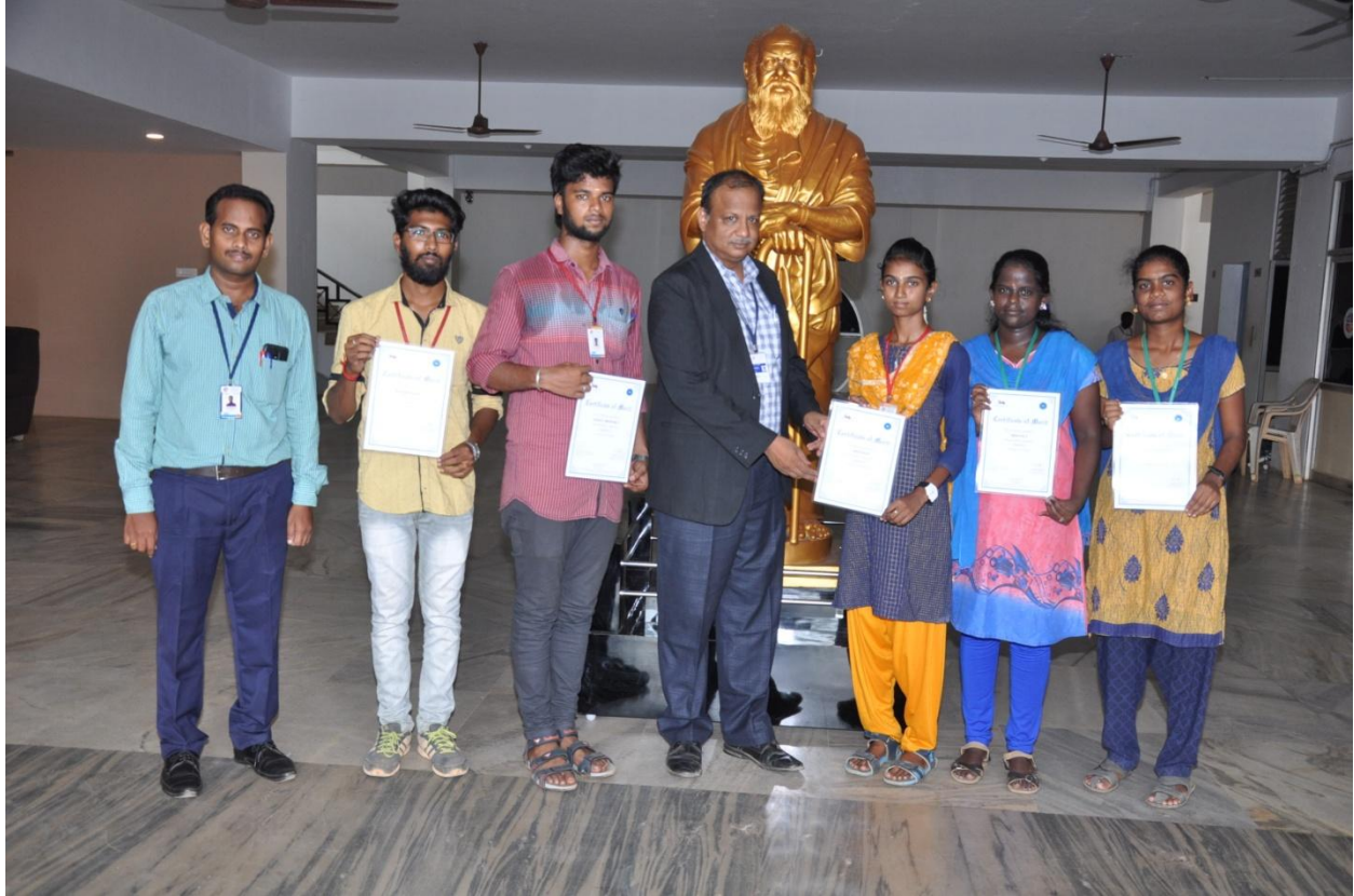
Certificates are distributed to the Participants after the completion of the Value Added Course on Tally with GST.